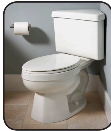
Titan™ PRO Triangle