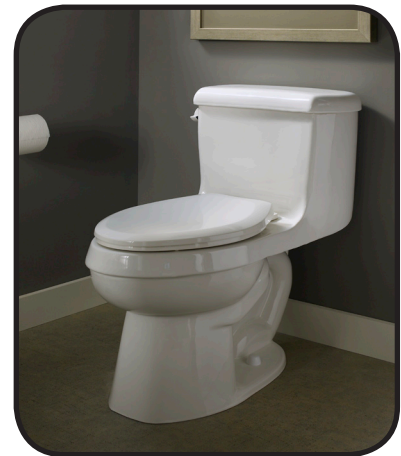
Titan™ PRO One-Piece