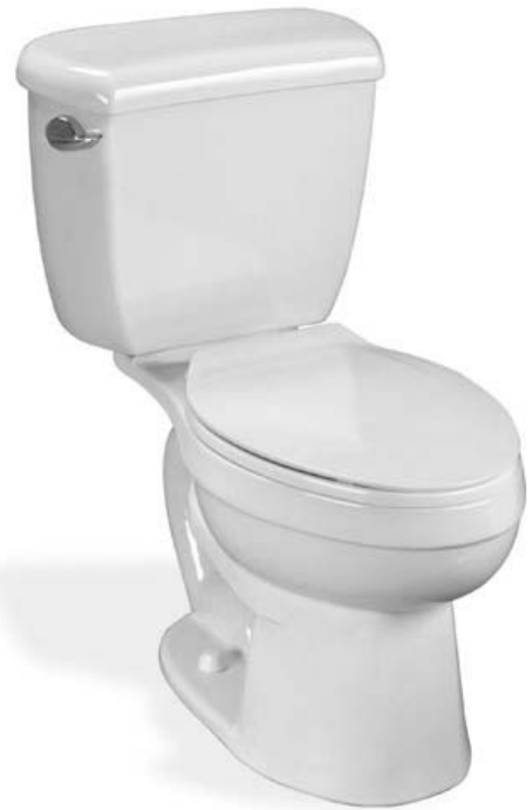
Toilet Seat Shown Not Included