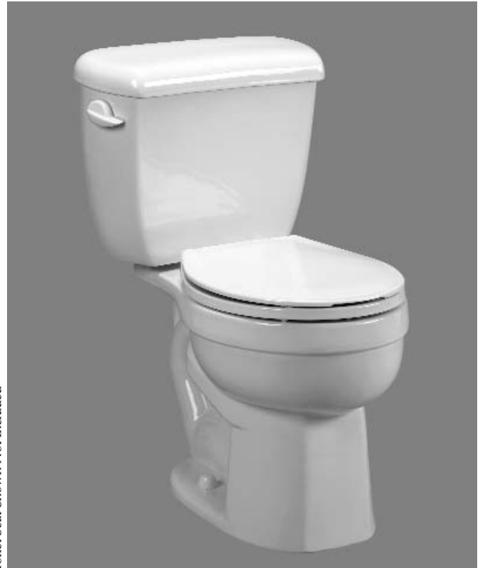
Toilet Seat Shown Not Included