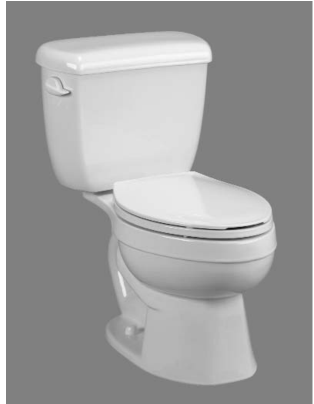
Toilet Seat Shown Not Included