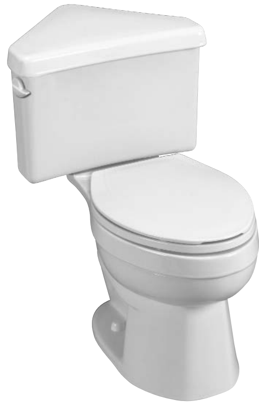
Toilet Seat Shown Not Included