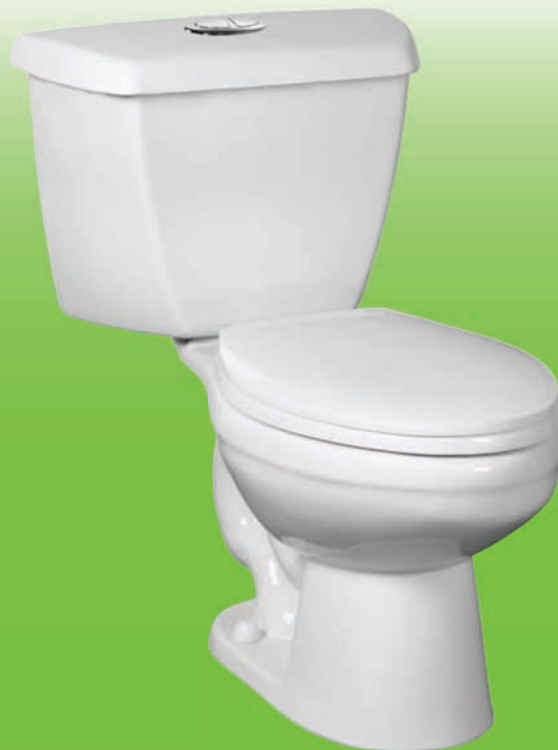
Shown with 8085 "Lift 'N' Clean" Toilet Seat