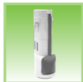
P030370 Dual, flapperless flush valve