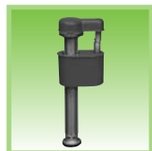
P030176 Pilot operated fill valve