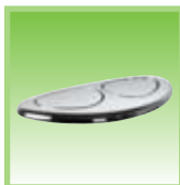
P030328 Dual action push button Available in Polished Chrome finish only.