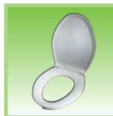
8080 Elongated "Lift 'n' Clean" toilet seat. Seat can be removed quickly for ease of cleaning.

Customer Service United States 41 Cairns Road Mansfield, OH 44903 Email: customerservice@craneplumbing.com