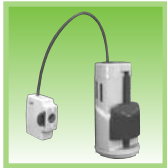
P030901 Flapperless, wire-driven flush valve