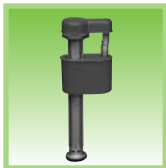
P030177 Pilot operated fill valve