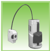
P030901 Flapperless, wire-driven flush valve