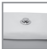
31615 Center push button