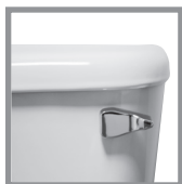
31613 Right hand trip lever