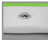
31625 Center push button - Single function

The Green Building / LEED programs was created to provide contractors, building engineers, developers and architects with incentives or rewards for utilizing energy saving and water conservation products in the construction or renovation of their buildings. The LEED program provides points or credits that can be used to offset elements of the construction that would be debits against the property. Using a 1.6 gpf / 6.0 lpf toilets as the baseline, a HET toilet or HEU urinal that has a minimum average water savings of 20% can earn one [1] LEED point, or a minimum water savings of 32% can earn two [2] LEED points.