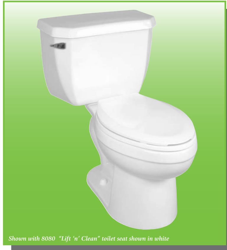
Shown with 8080 "Lift 'n' Clean" toilet seat shown in white