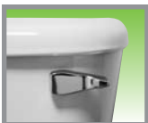
31961 Right hand trip lever