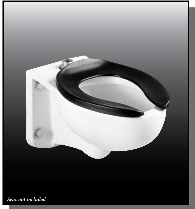
Seat not included